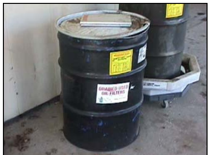
Used Oil Filter Drum