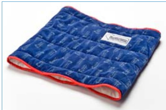
Padded one-way slide