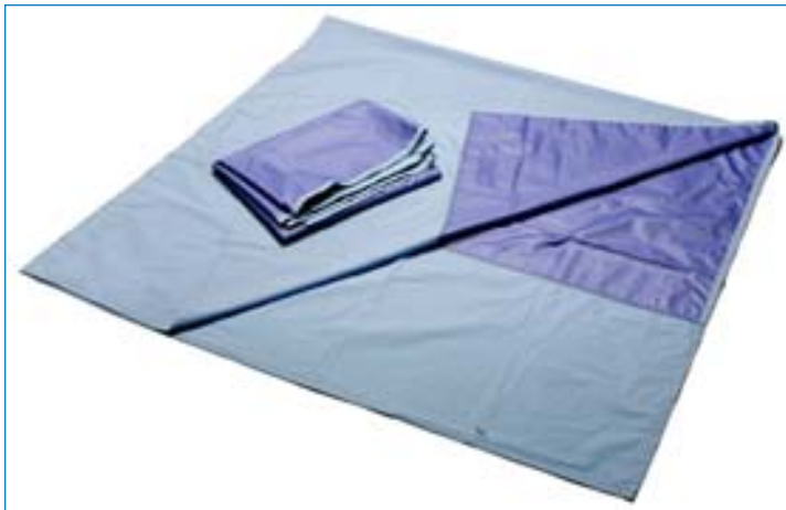
Set of two draw sheets