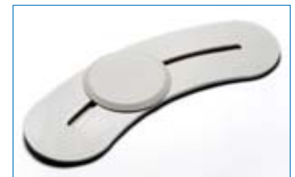
Smaller slide/transfer boards with movable sliding sections

with moveable sliding sections. Be careful when using slide/transfer boards with sliding sections because these sliding sections may cause pinching.