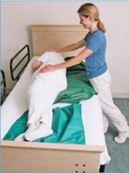
Two flat sheets