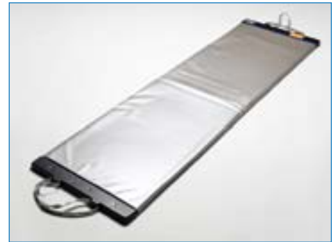
Rolling slide/transfer board

These boards are suitable only for those patients who can power themselves by sliding or rolling along the board with guidance from a knowledgeable caregiver. Some procedures require the caregiver to push or pull the board to accomplish the transfer. Others involve pushing the patient or pulling a draw sheet across the transfer board. Large patients and patients with sensitive skin may find slide/transfer boards uncomfortable. If possible the use of a mechanical lift is recommended over a slide/transfer board.