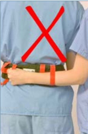
Never place your arm through transfer belt handles