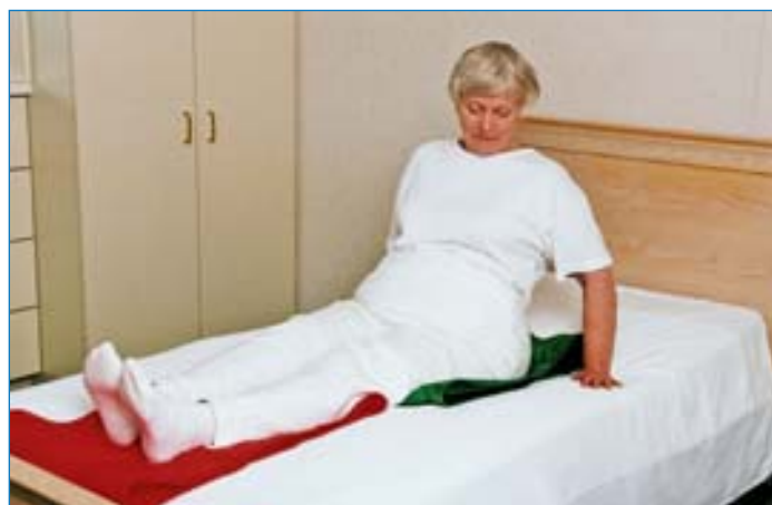
Two roller sheets