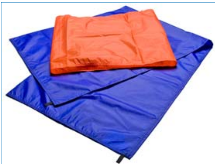
Set of two slider sheets

is repositioned. Longer draw/slide sheets cover more of the contact area between the bed and the patient's body, but they also tend to be more difficult to remove.