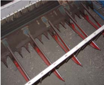
Combine Sickle Bar Cutting Point

When two mechanical parts move close enough together to process crop material such as in a grain auger, a shear point hazard is created. Similarly, when a mechanical part moves rapidly or forcefully enough to cut plant material such as wheat, a cutting point is created. Agricultural equipment and machinery often have shear or cutting point hazards including sickle bars, rotary blades, flail blades, and auger blades. California Code of Regulations (CCR) addresses shear and cutting points under Title 8, Sections 3440, 3441, 3445, and 4002.