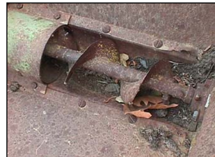
Grain Auger Shear Point