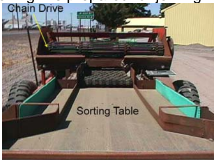
Potato and Onion Harvester Sorting Table

Always mount the potato and onion harvester before it begins moving and dismount after it has stopped moving. Be prepared for jerking motions when the tractor begins towing or stopping the harvester.