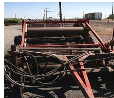
Potato and Onion Harvester Hydraulic Lines

A hydraulic system is used to raise and lower the harvester and adjust the conveyors and sorting table. Injuries caused by hydraulic systems range from burns and injected fluids to contusions and lacerations. Prior to use, always inspect hydraulic hoses and fittings for leaks and to assure they are securely attached at connection points. Any hydraulic component that fails a pre-use inspection shall be removed from service by attaching a red tag that states "DO NOT USE." Lower hydraulic components to the ground before shutting off the engine. Thereafter, relieve all hydraulic pressure before disconnecting hydraulic hoses.